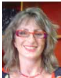
Wellbeing Collaboration Project Manager

After 18 months in the Wellbeing Collaboration Project Manager role, I am moving on to live and work in the UK for a while. I have had a wonderful time in my current role and have thoroughly enjoyed myself at the same time as gaining new skills and knowledge. Since visiting the UK on a study trip in 2004, I continued to be inspired by the potential of social and community enterprise to transform communities, neighbourhoods and organizations at the same time as creating sustainability, independence and local employment. So I am off at the end of May to find out more..... with the intention of returning to Waitakere in the future armed with more inspiration and experience. It is anticipated that the new Collaboration Project Manager will start around the end of June.