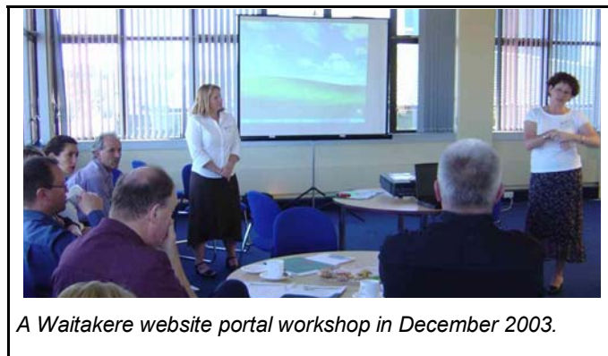
A Waitakere website portal workshop in December 2003.

The Mapping component will provide data in the form of maps, enabling local comparisons and identifying gaps. The Online component will provide additional and timely information electronically and will link to a wider Waitakere website portal project.