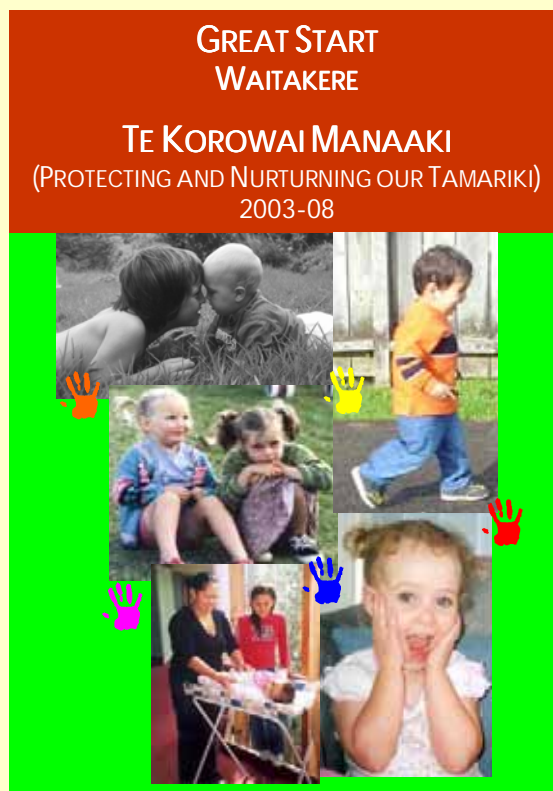
The “Protecting our Tamariki” Action Plan (above) was launched this month