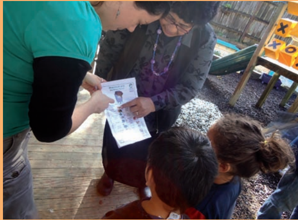
Parents and children find out how to start a worm farm.

The literacy and numeracy course helps upskill the parents in order to help with their children's education by assisting with their home work. It is also aimed at assisting in filling out forms by helping with grammar, pronunciation of words, comprehension, and more.