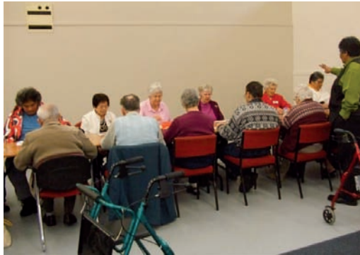
New paint has freshened up the Massey Community House.