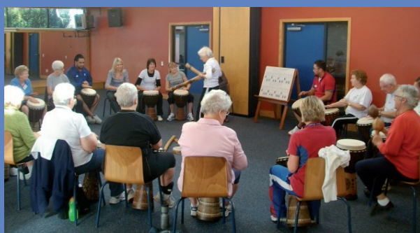
Active Massey residents enjoying N2O fun.

In June, the YMCA Massey celebrated the second birthday of the Never2Old programme. Never2Old is a gym-based programme for over 60's. Developed by the Auckland University of Technology in 2002, it focuses on getting mature adults more physically active and fit, in a safe and professional environment.