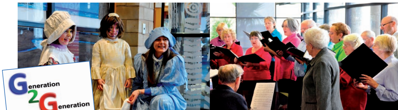
Left: Dressed up in heritage costumes for a photo. Right: The choir in full voice.

One in three women in New Zealand are victims of violence from a partner, while on average 14 women are killed each year by a member of their own family. You can help effect change by supporting White Ribbon . White Ribbon is a campaign led by men who condemn violence against women and take action. Show your support for the campaign to stamp out family violence by joining the Waitakere White Ribbon Day parade on November 25. The march will start at 1.30pm from Waitakere Hospital, Lincoln Road (please be there for 12.30) and make its way down Great North Road to Falls Park.