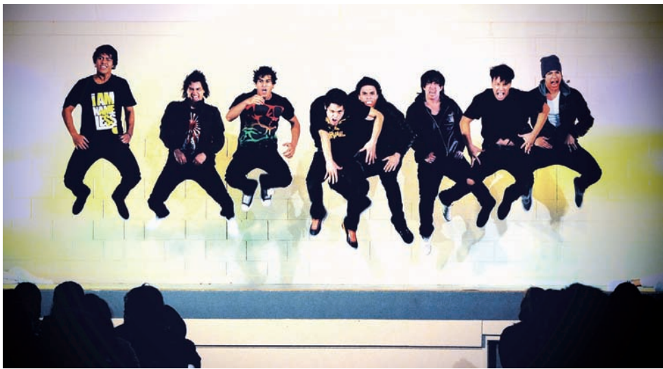
The Limit Break Dance Crew in action.