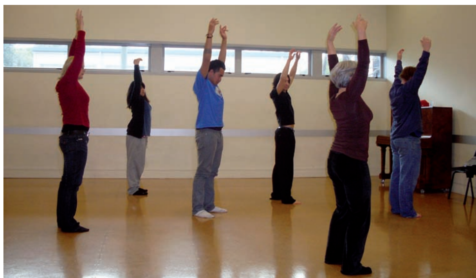
Participating in the contemporary dance demonstration.