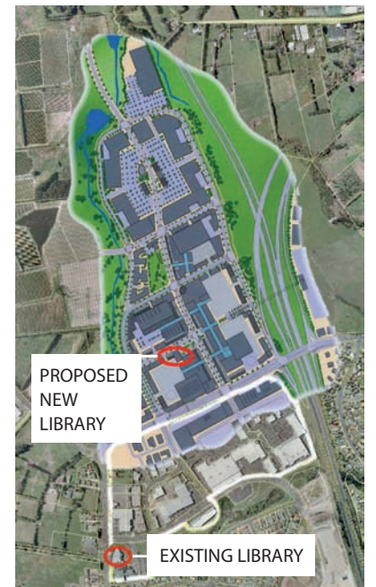
Left: Initial concept for library and town square. Right: Aerial view of the new Westgate development