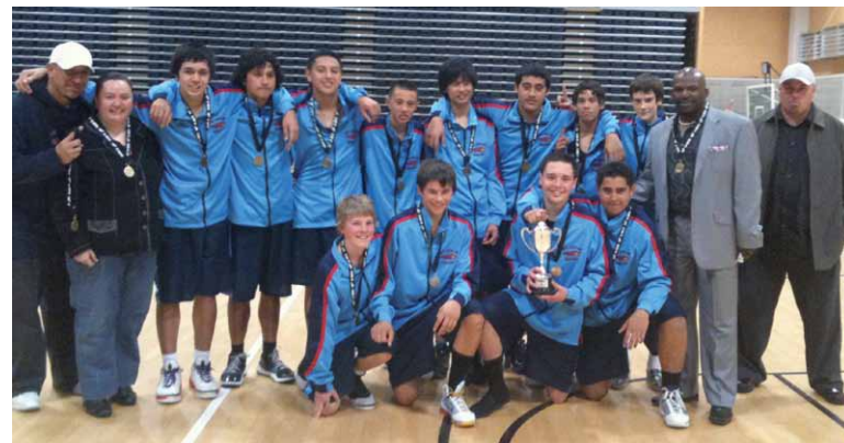
Above: The successful U15 boys with their support team.