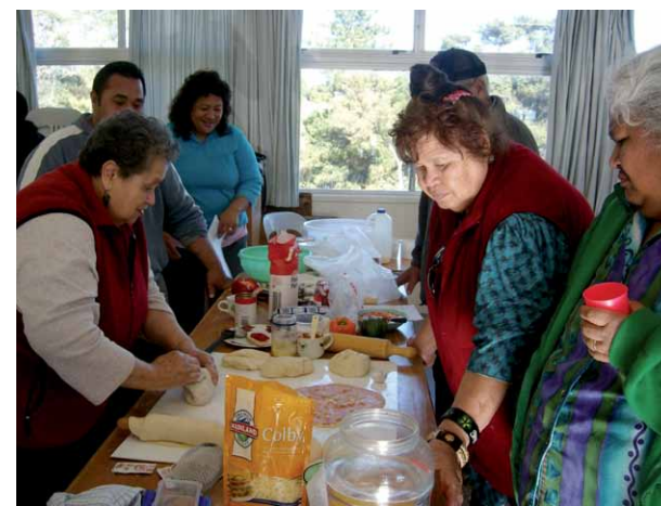
Making a pizza base, a first for some of the students.

This project was part of an extended adult education programme supported by Back 2 Back.