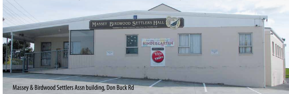
Massey & Birdwood Settlers Assn building, Don Buck Rd