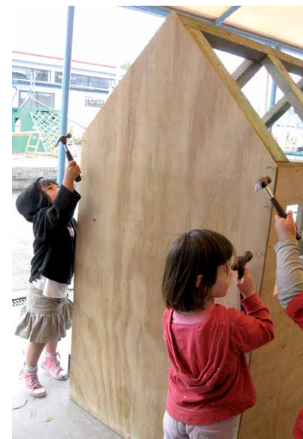
The children helping with the building of their Enchanted Garden house.

With so many wonderful additions to the area, the children's imaginations have run riot. We are all so proud of our special new enchanted garden area.