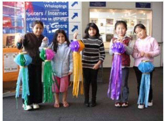
During the workshop and after completing the task, children posed with their lanterns.