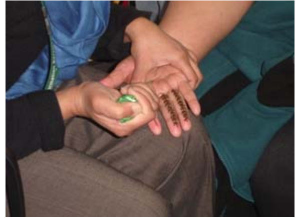
Many women got their hands painted with Henna patterns.