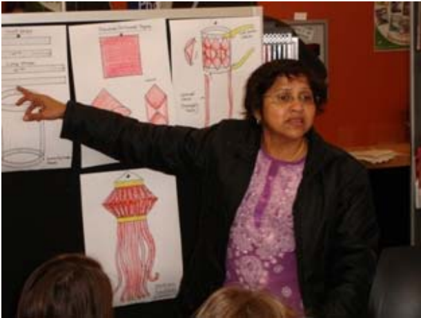
Lantern making workshop was popular among children.