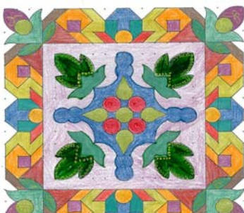
Winning Entry from Ranui Library

In its fifth year Rangoli Colouring-in Competition is sponsored by Radio Tarana, an Indian Radio Channel. Libraries had an overwhelming response to the competition with 252 actual entries from its six library branches excluding Titirangi which was under refurbishment.