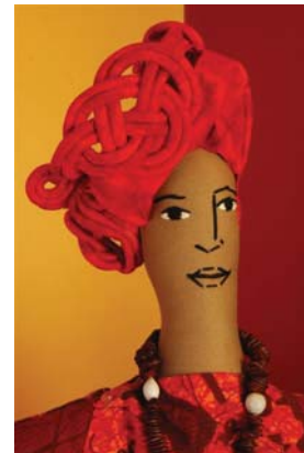
Claire Inwood: Doll at West Coast Gallery

some of the problems associated with pollution and lack of vegetation. They have made a 'model' stream with clean water inhabited with an abundance of plants and wildlife.