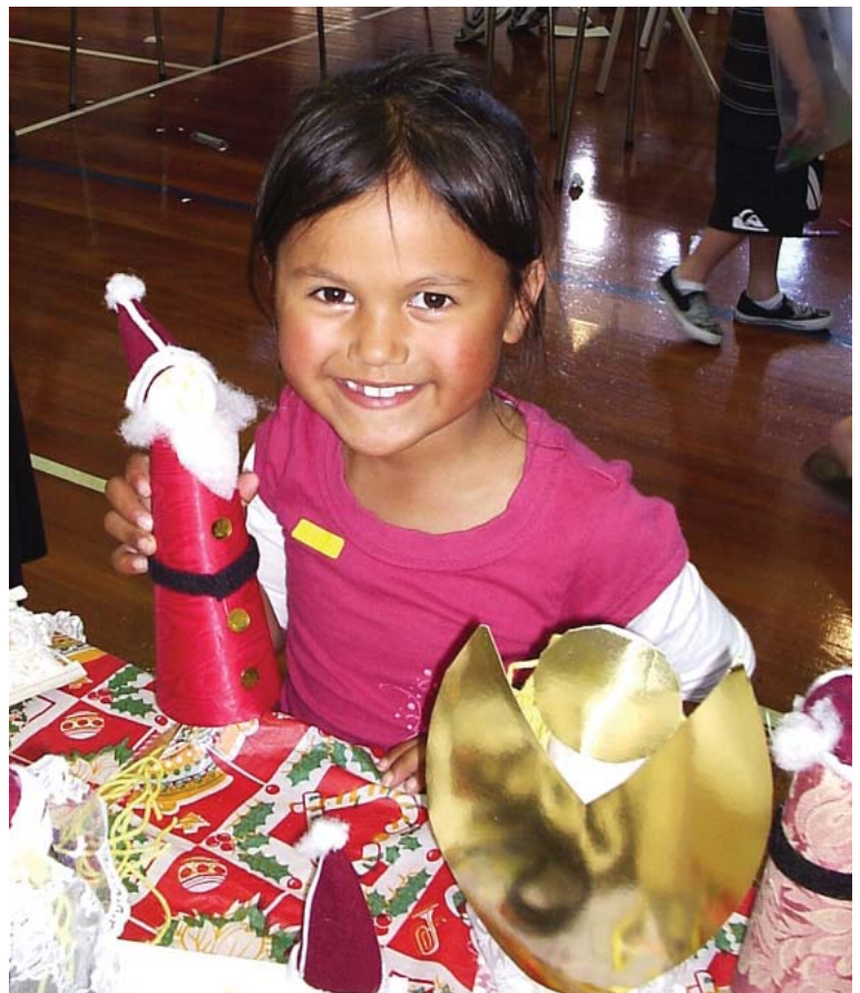
Happy participant at Christmas Giftmaking 2007

Children must be pre-registered in order to attend Christmas Giftmaking and they also need to be accompanied by an adult on the day. To register your child phone the WCC Call Centre (above).