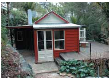
The McCahon House Cottage

Volunteers find this work very rewarding and have the opportunity not only to be part of an exciting project but also to get to know the resident artists and be part of a team passionate about art and an important heritage feature of Titirangi.