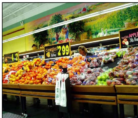
Regular inspections are made of premises selling foodstuffs—this one passed