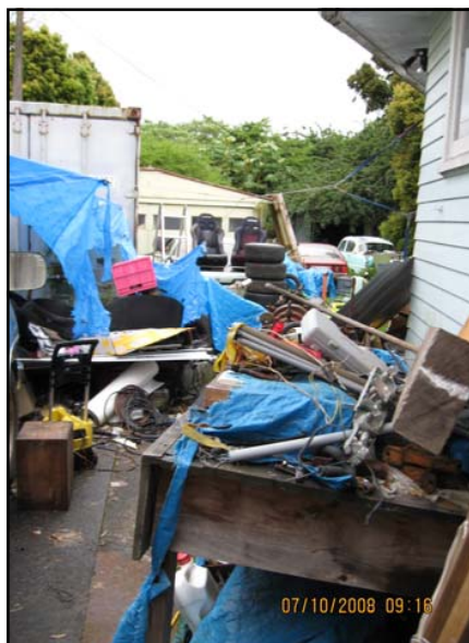
Environmental Officers inspected this property as a result of a complaint. If not cleaned up, enforcement action will be taken