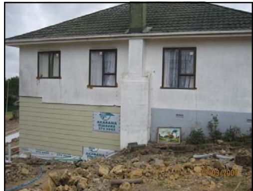
Non consented and non complying building works. Work needs to be brought up to standard