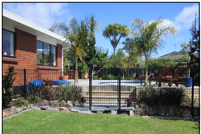
Fencing around this swimming pool is compliant