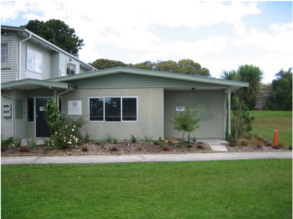
Photograph showing the existing single storey element of the existing abuse and trauma counselling service.