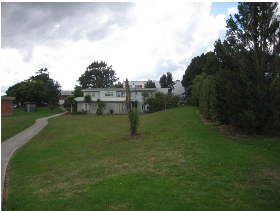
Photograph indicating proposed site showing rise in landscape and shelter vegetation between the site and the neighbouring houses at 260-264 Te Atatu Road.