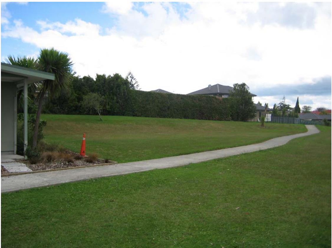
Photograph showing location of the proposed building.