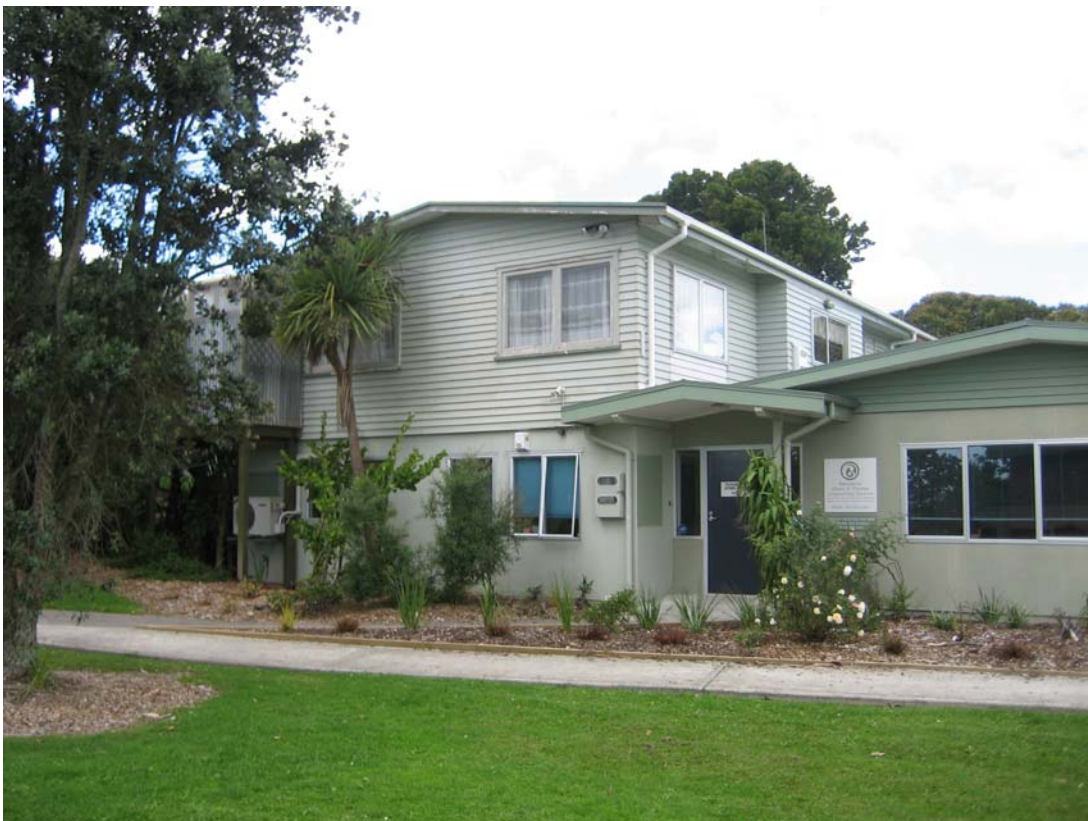
Photograph showing existing storey element of the abuse and trauma counselling service.