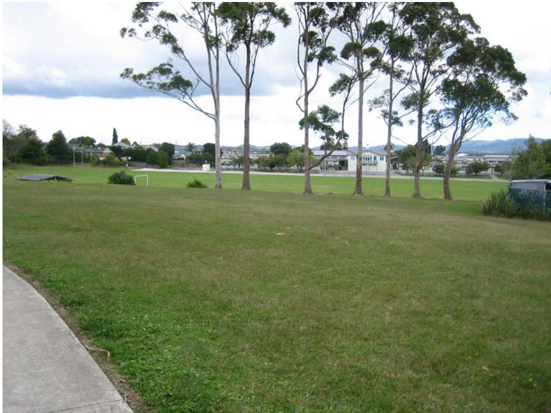
Photograph showing view across the park into the neighbouring Rangeview Intermediate School playing fields.