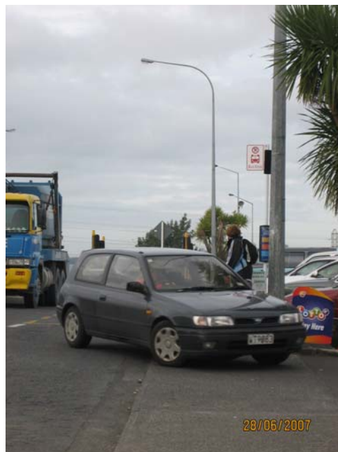
Photo showing bus stop near to the application site