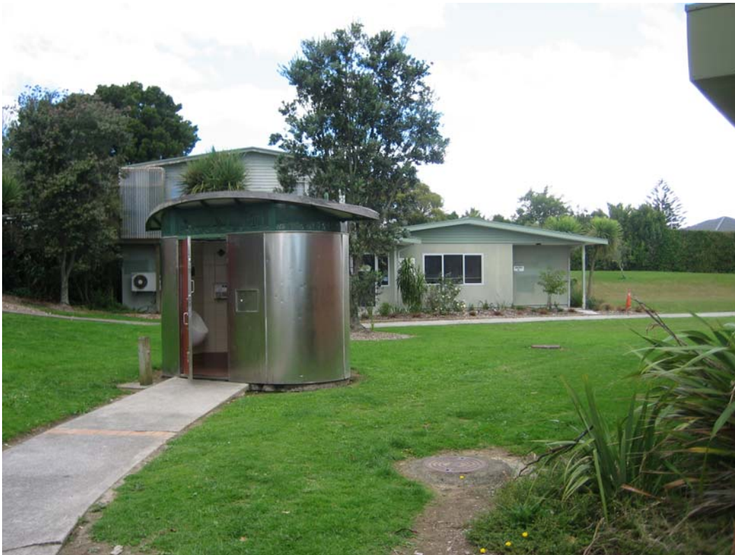
Photograph showing the existing abuse and trauma counselling service buildings on site and the public toilet.