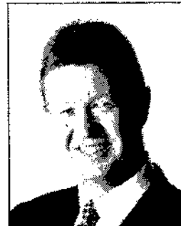
Serving: Blockhouse Bay, Green Bay, Huiā, Laingholm, Parau, Lynfield, New Lynn, New Windsor, South Avondale and Tītirangi