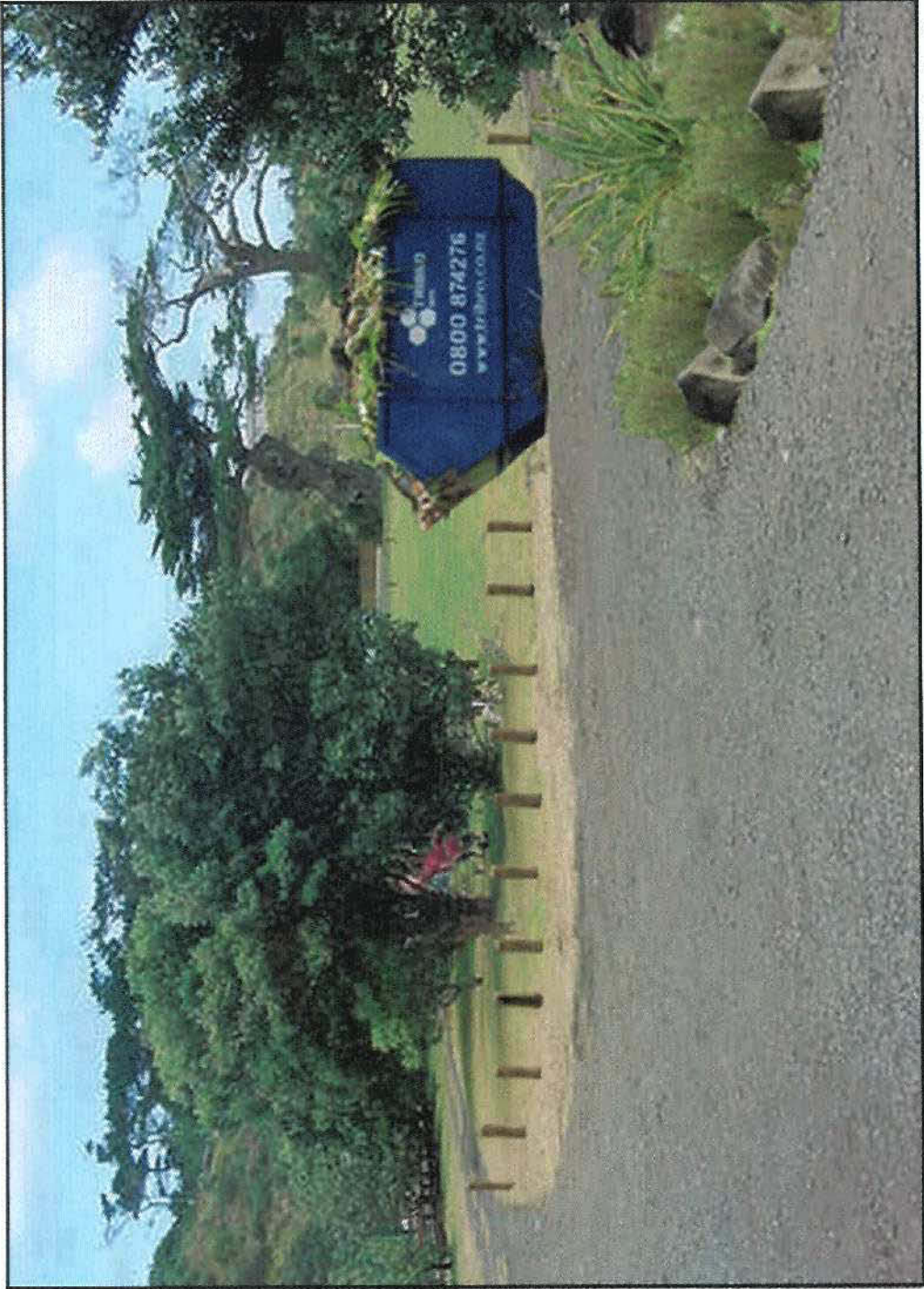
Proposed Weed Bin, Turning Bay & Rain Garden