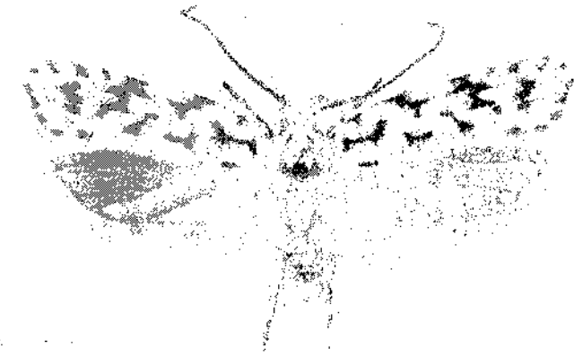
SPECIMEN: Sigrig Rhode's green Indian moth. In Suggested at Lopdell House.

Insects are celebrated in an inventively conceived exhibition called Suggested , running until the end of next month at Lopdell House in Kihirangi. Here, art intersects with science.