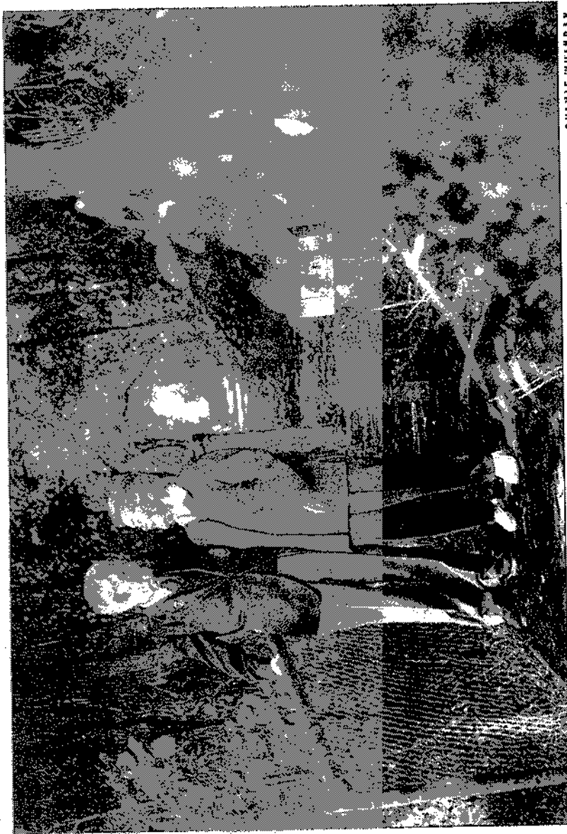
Wally and Thelma Burrow are thrilled an historic walk they have used often will be revamped

Now, the council will cut back overgrown trees and bushes to open up a sea view. Plans for a $7000 grant