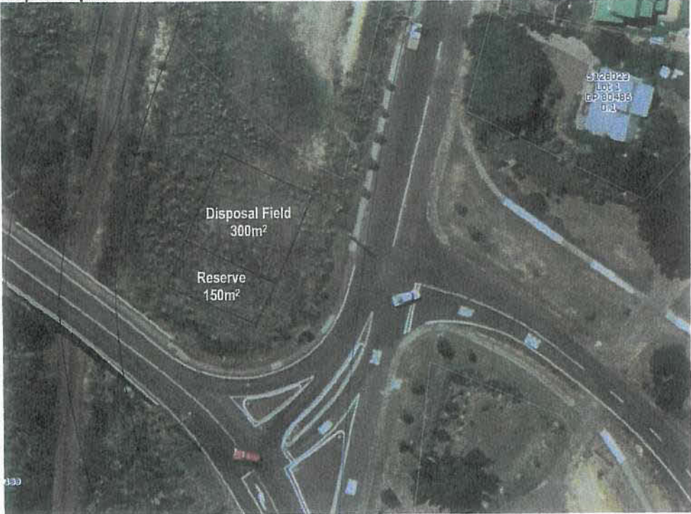
Indicative disposal area based on design flow of 1.2m³. May change upon detailed design. For consultation purposes only