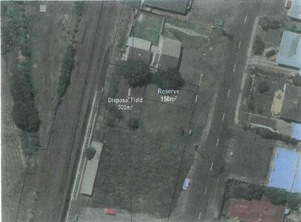
Indicative disposal area based on design flow of 1.2m³. May change upon detailed design. For consultation purposes only