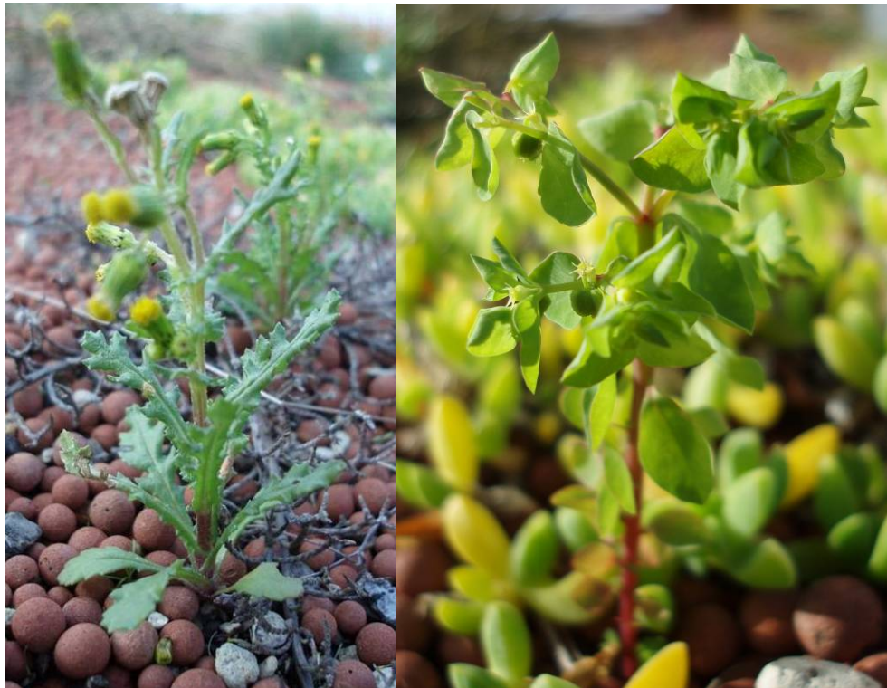
Common groundsel Senecio vulgaris (Europe, LHS) and Milkweed Euphorbia peplus (Europe RHS)

(scale: expanded clay balls are 4 to 6 mm diameter)