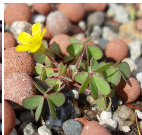
Pearlwort Sagina procumbens (Europe, LHS) and Horned oxalis Oxalis corniculata (L.) (Europe, RHS) (also known as yellow wood sorrel)