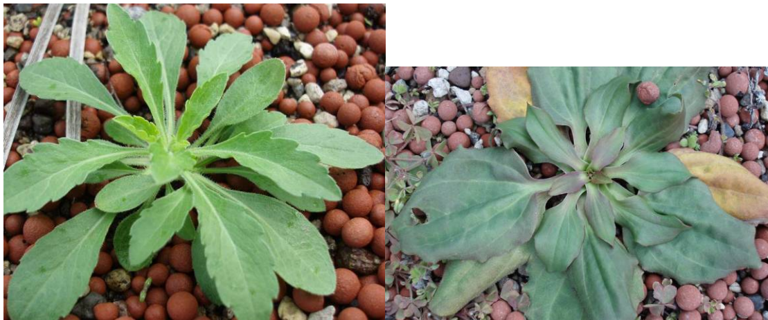
Fleabane Conyza sp. (N. America, LHS) and broadleaved plantain Plantago major (Europe, RHS)