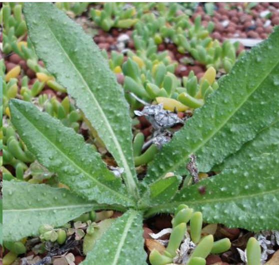
Dandelion Taraxacum officinale (Europe, LHS) and Bristly oxtongue Picris echioides (Europe, RHS)