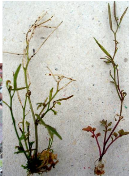
Sowthistle Sonchus oleraceus (Europe, LHS) and bittercress, Cardamine hirsuta (Europe, RHS).