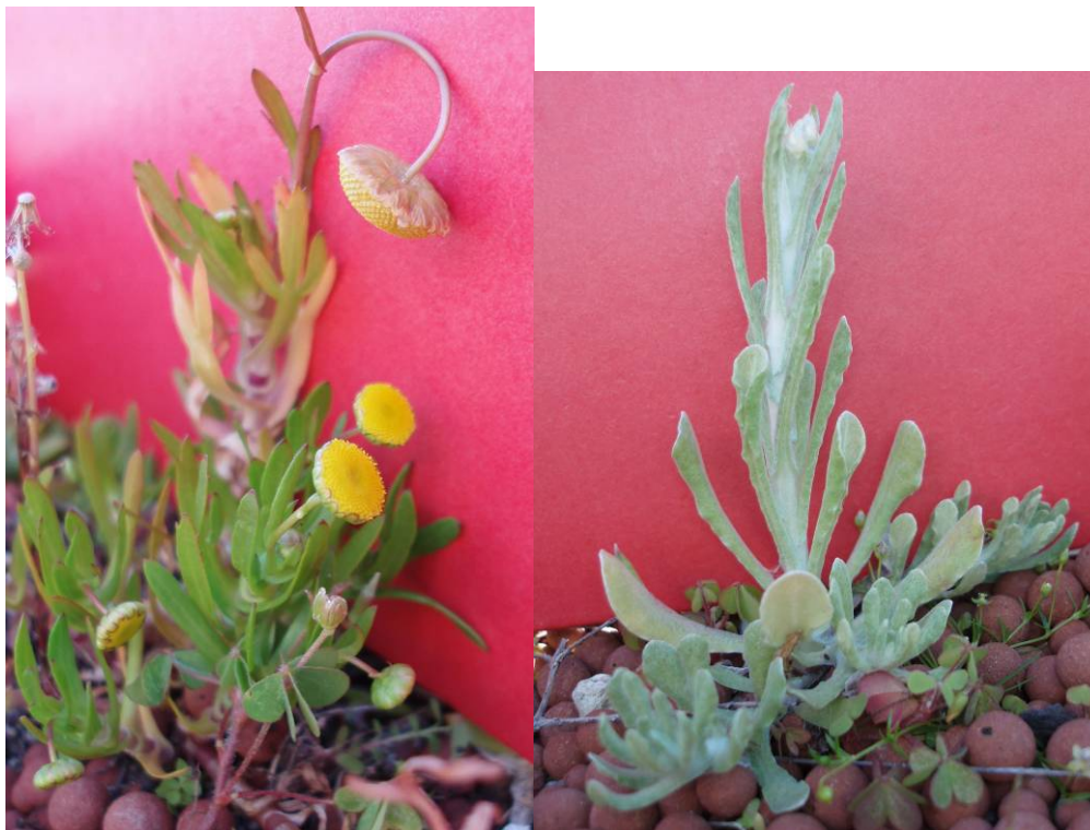
Bachelor's buttons Cotula coronopifolia (L.) (native - cosmopolitan) and jersey cudweed or pukatea Pseudognaphalium luteoalbum (L.) Hilliard and B.L. Burt (native - cosmopolitan)