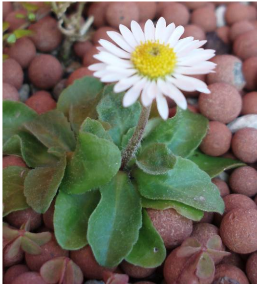
English daisy Bellis perennis (L.) (Europe).