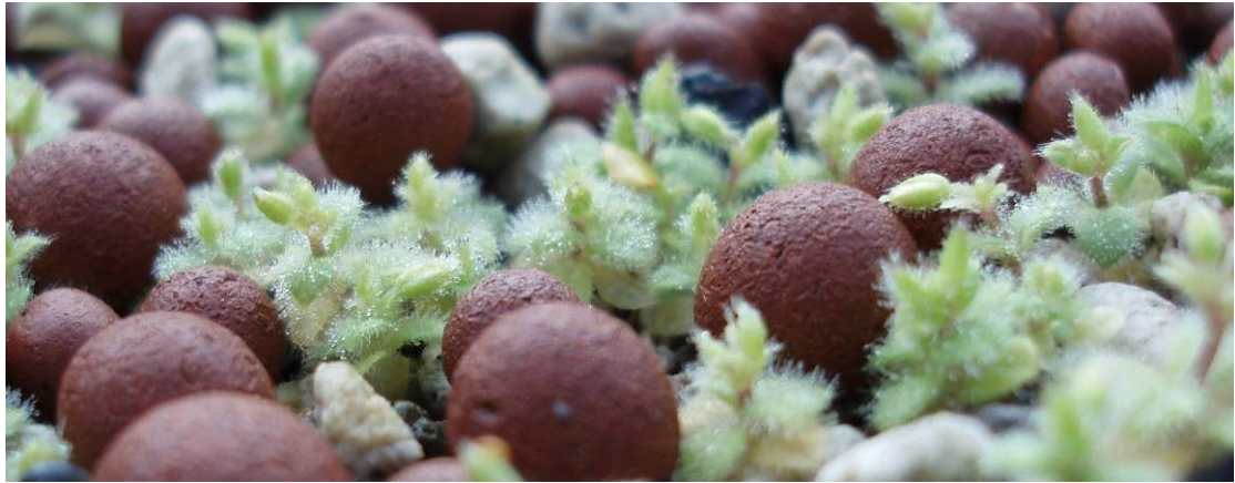
Unknown tiny hairy and profuse weed yet to be ID!