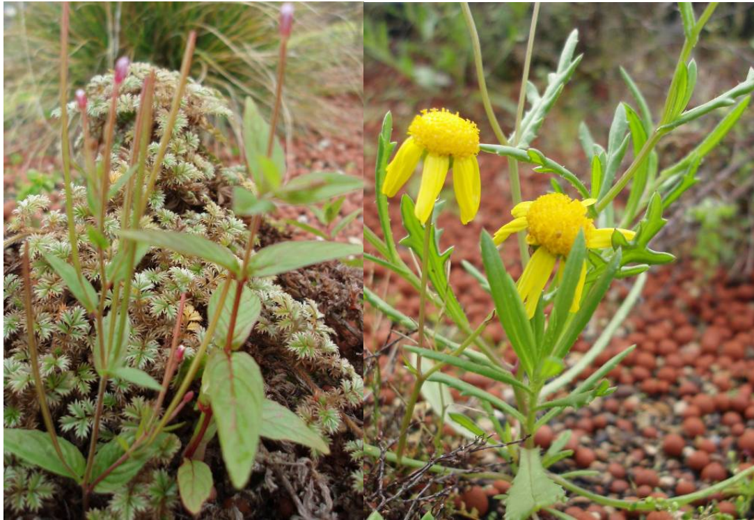
Epilobium ciliatum (N. America) (with the native bidibid, Acaena microphylla in the background, LHS) and Gravel groundsel Senecio skirrhodon (S. Africa, RHS - only 3 of these found on the roof on first sighting June 2007)