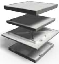
Exploded 3-D View of the Layers of the Prosthetic Habitat

The artificial habitat refuge is being developed as a potential substitute for the typical refuges and habitats that would otherwise be afforded by the features within a natural environment. Such a device is being conceptually termed by the researchers as a prosthetic habitat. In this context a prosthetic habitat is an artificial substitute, designed for functional and/or aesthetic reasons, and can be either removable or permanent.