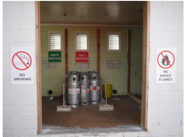
LPG Forklift cylinders safe and secure