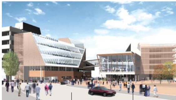
UNITEC Campus extension | Road Lane to Trading Place | Waitakere Central Library | Plaza | Carpark building