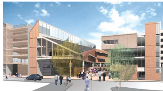
Carpark building | Waitakere Central Library | Road Lane to Ratanui Street | UNITEC Campus extension