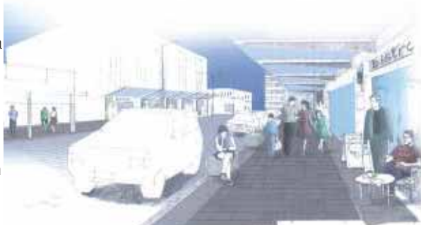
Artist's impression: Railside Ave looking north

The first area to be refurbished will be the area: Railside Ave (from Stevie's Lane) through Ratanui St to Alderman Drive. This includes a major overhaul of the Great North Rd/Railside/Ratanui St intersection, itself. Catherine Mall will also be gutted and re-landscaped.