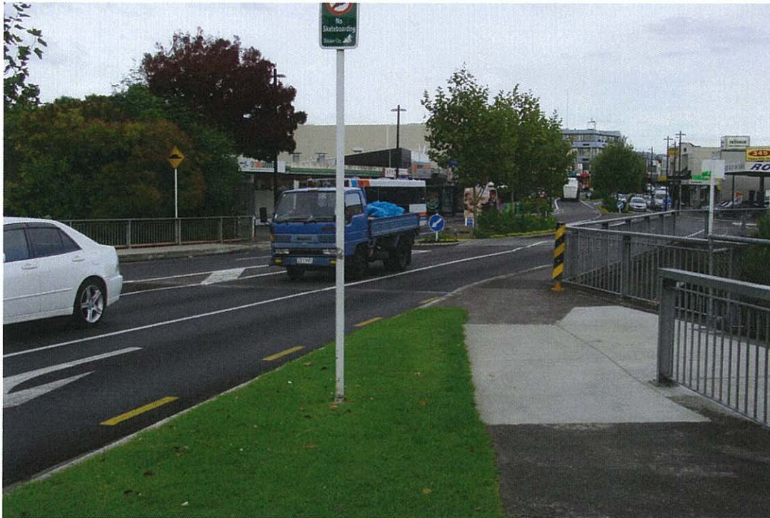
Oratia Stream Bridge