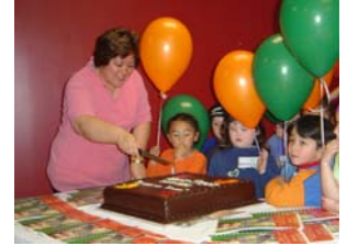
Te Korowai Manaaki Great Start Launch