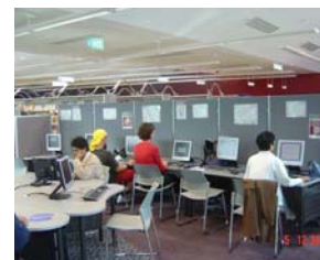
A learning space environment