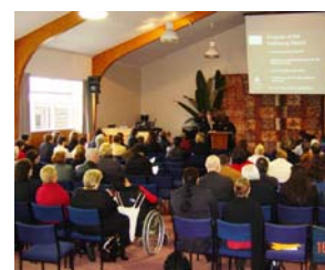
Upper: Wellbeing Summit 2002; Lower: Wellbeing Summit 2004