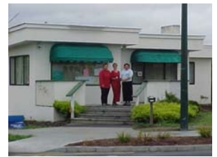
The Ranui Action Project House - a community owned asset