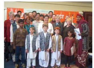
Ranui Refugee Day Celebration July 2004