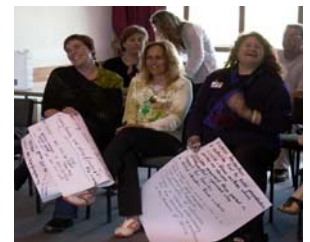
Great Parenting Service Providers Forum