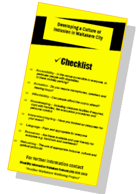
The Culture of Inclusion checklist was developed for meeting organisers