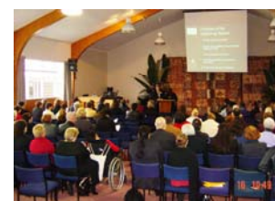
Upper: Wellbeing Summit 2002; Lower: Wellbeing Summit 2004