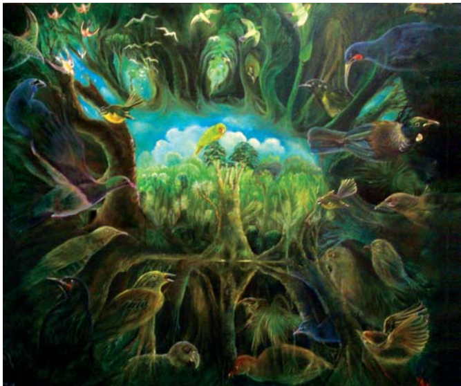
Flight of the Kakapo by Zeke Wolf, 2008 Waitakere Trust Award winner