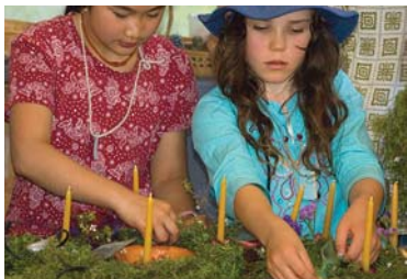
Advent Fair, 2008

Younger children love to visit the Fairy Queen in her secret flowering bush grotto and enjoy treats in the magical children's café and puppet plays. They can even buy handmade items all by themselves from the children's bazaar.