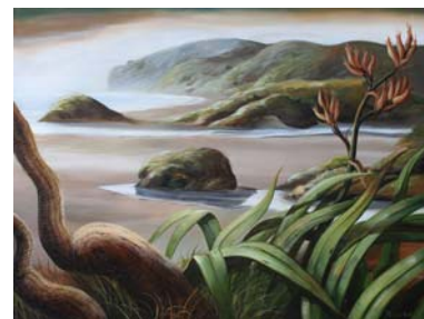
Anawhata Dry Brush, Monique Endt

View Monique's new paintings of our West Coast beaches, featuring a series of tree ladies and men dancing and twisting their textured branches.