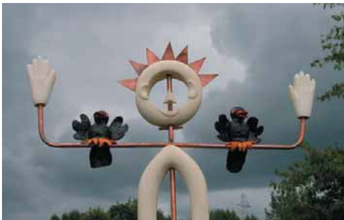
2006 Entry by Diane McGarvey

Entries are being accepted now for this year's Kumeu Scarecrow Festival . Make your own scarecrow and view the scarecrows on display at participating venues throughout the area.