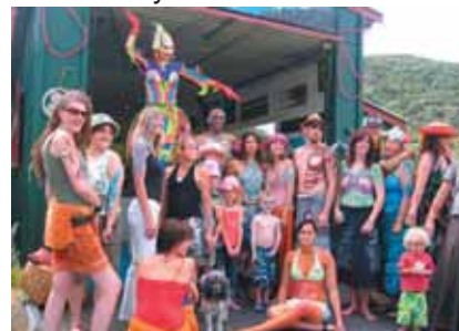
Painted up and ready to celebrate!