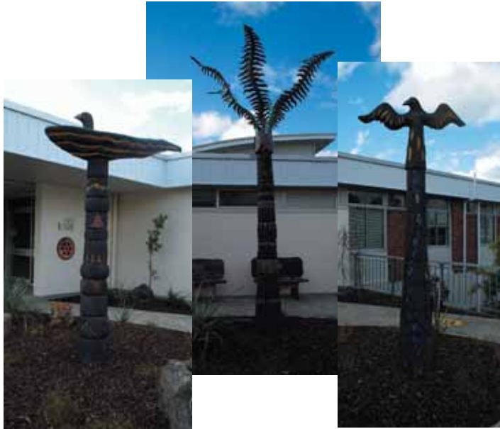
Three freestanding totems outside Waitakere Hospital entrance.