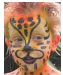
a happy participant

Special thanks to Waitakere City Council and Creative Communities for their support. Enquiries ph 8128 029.