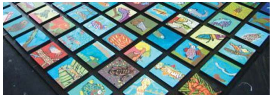
detail of the Sunnyvale School mural

Date: March 7-8 Time: 10am-4pm For free brochure or bus tour bookings: tel. 839 0400 or web: www.waitakere.govt.nz/ArtCul/ae/index.asp#openstudio