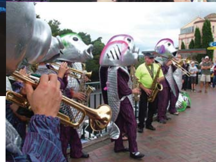
Scenes from TFOM08: (left) Libretta Suede, (top right) 1 Million Dollars, (bottom right)