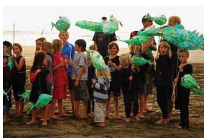
Images from Art on the Beach '09 by Clive Taylor: top: The Big Fish; bottom: School of Fish