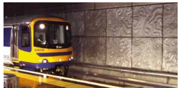
The concrete panel artwork by Louise Purvis.