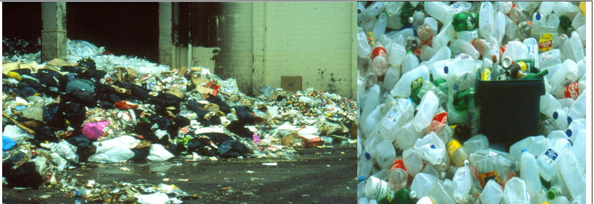
Co-mingling of waste in disposal bags makes separation for recycling nigh impossible – more source separation is required