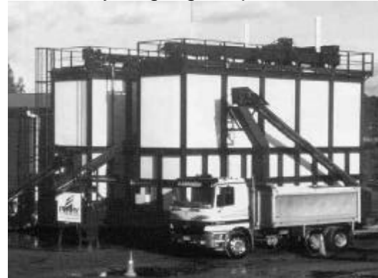
The Waste Minimisation Learning Centre, the move to user charges for rubbish collection, and the installation of the first Vertical Composting Unit in NZ have all contributed to reducing waste to landfill.