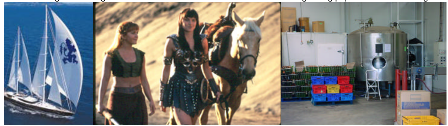
Cluster support for the marine, film and organics industries is showing results, with employment in these sectors growing to 2.7% of local jobs