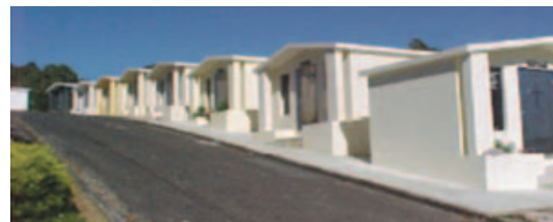
Mausoleums at the Waikumete Cemetery.

In addition to these negative impacts, Waikumete and Swanson Cemeteries have a number of positive environmental, social and cultural impacts. Both areas act as an open space (Waikumete Cemetery is held by the Department of Conservation under the Reserves Act) and are important places for local communities to recreate and contemplate.