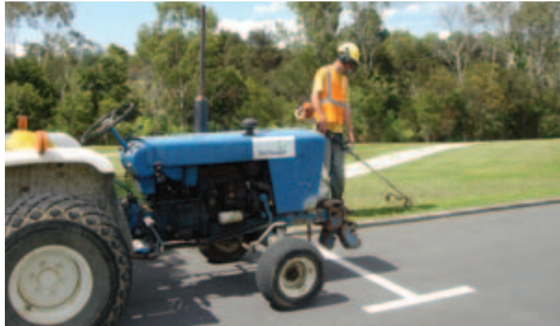
A Techscape contractor undertakes lawn maintenance at the cemetery.

New capital expenditure is funded from loan as this is considered to benefit both the current and future community. Renewals are funded from the proceeds from rating for depreciation as this funding is considered appropriate as depreciation reflects reduction in service potential and expenditure on renewals is to restore service potential. As some of the capital expenditure can be attributed to growth, a portion is funded from Development Contributions.