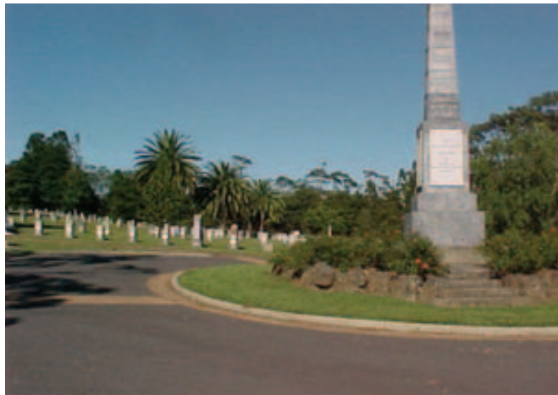
The Cenotaph is a memorial to First World War soldiers.