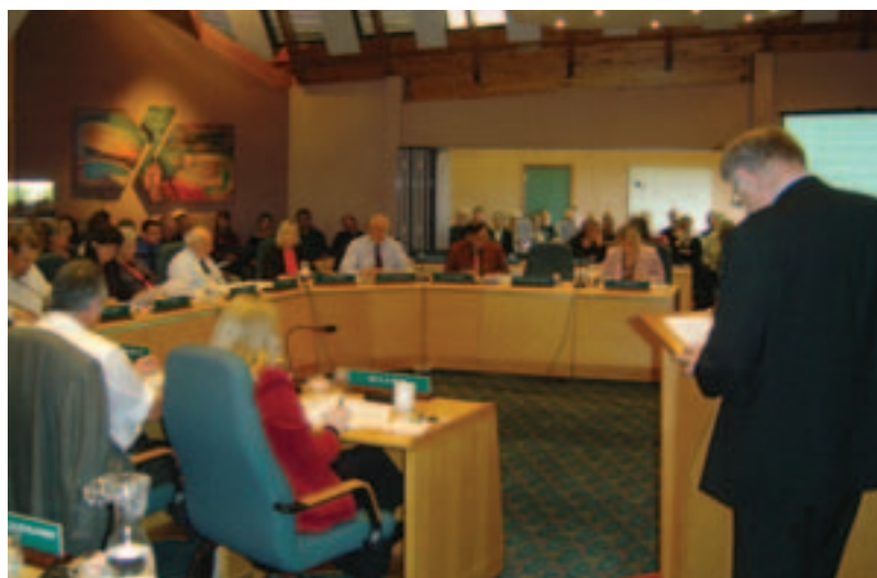
A staff member speaks to elected members at a Council meeting.

Democracy is an activity which is reviewed on a regular cycle by both the management and elected representation of the Council. Given that it forms the governance of the Council and supports all elected members, this activity is key to the Chief Executive Officer and the Directors Group as a whole.