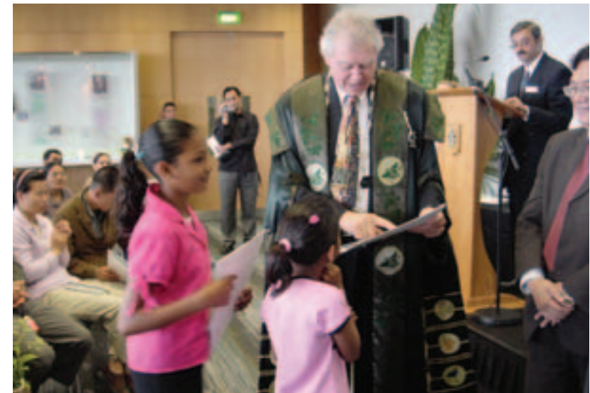
Citizenship ceremonies are an important council activity.

The Council has a legal requirement under the Local Government Act 2002 to provide services for the administration of the Council’s decision-making processes through publicly notified and open public meetings and to ensure that they are conducted under a set of rules known as Standing Orders. Local Governance Statements are prepared under this legislation. Elections are conducted as required by the Local Electoral Act 2001. Information flows are regulated by the Local Government Official Information and Meetings Act 1987 and hearings are conducted under the provisions of the Resource Management Act 1991.