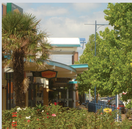
Newer development often turns its back to the street. Blank walls create an unfriendly street.