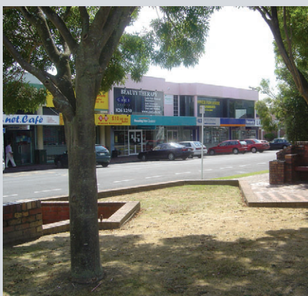
The older part of the centre displays a strong connection between buildings and street.

People friendly streets encourage 'meeting and greeting' as well as ease of movement.