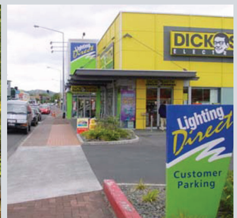
Through good design it is possible to combine an active street frontage with on-site car parking.

The adopted district plan changes are part of Waitakere's Growth and Transportation Integration Programme – a response to the Local Government (Auckland) Amendment Act 2004.