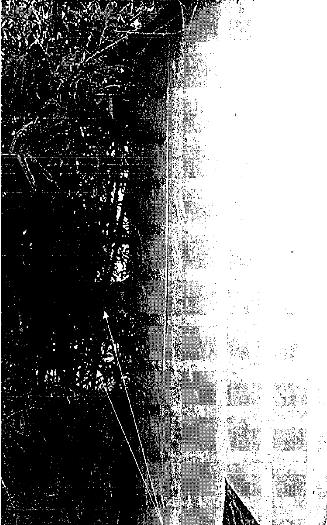
FENCE WITHIN BAMBOO