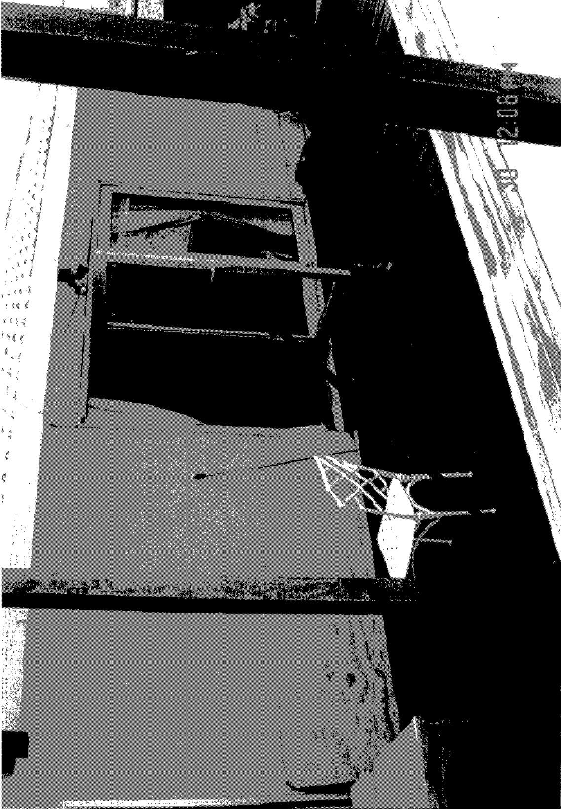
Sliding Bifold Door with outward swinging section