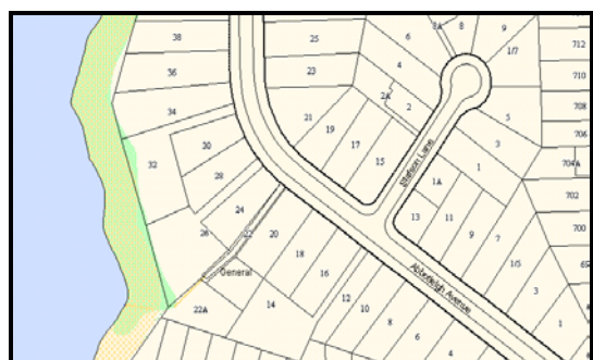
Figure 3: Natural Environment