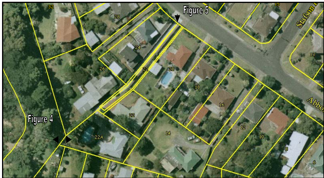
Fig 1: Location Plan