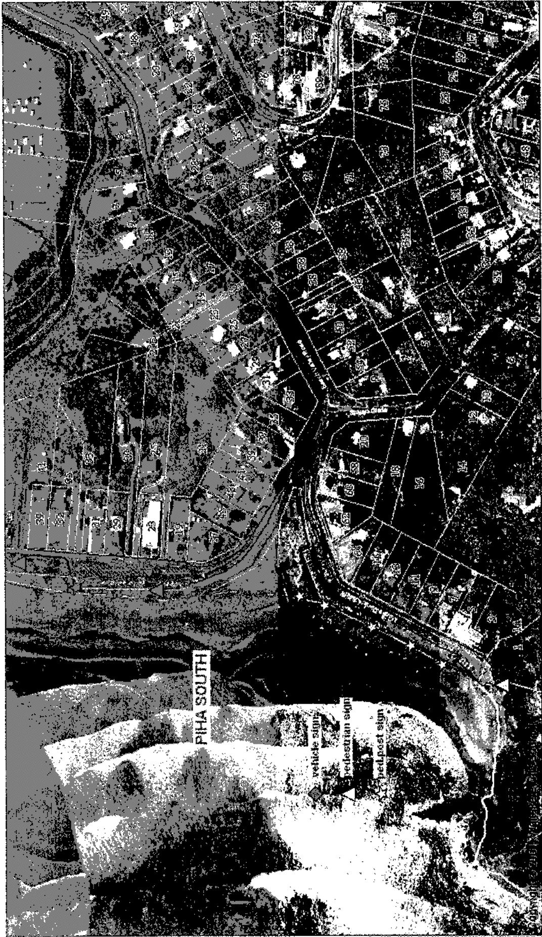
Location maps of proposed water safety signage