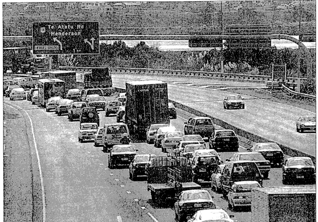
RELIEF IN SIGHT: Transit hopes its regional highway strategy will free motorists from the daily crawl along the northwestern motorway.

Among Transit's plans that will affect the west are an extension of the northwest-