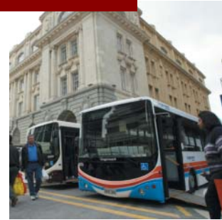
Britomart Transport Interchange

With the relocation of the Civic Centre, the Council is taking the opportunity to create a cluster of buildings designed expressly to help the Council to function better, to help the CBD to function better and to encourage public transport to undertake its full role in the future.